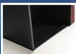
Durable modular base slides easily and supports door