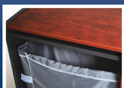
Nylon bag hooks make bag fit tight so no paper misses the bag