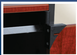
190° nylon hinge for unobstructed collection