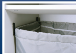
Nylon bag hooks make bag fit tight