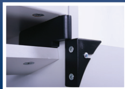
190° nylon hinge for unobstructed collection